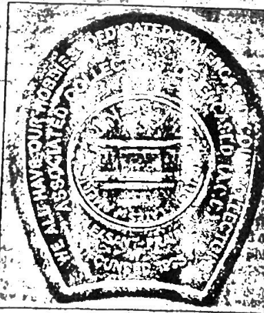
This is one of three encased coins available from ACE.

The obverse and the reverse are the same on all three. The back reads WE